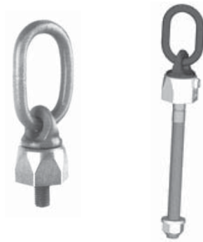
Lifting points bolted WBG-V / WBG

This safety instruction / declaration of the manufacturer has to be kept on file for the whole lifetime of the product.